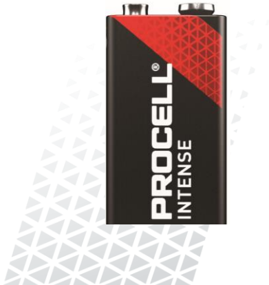
Size: 9V (6LR61) DURPX1604